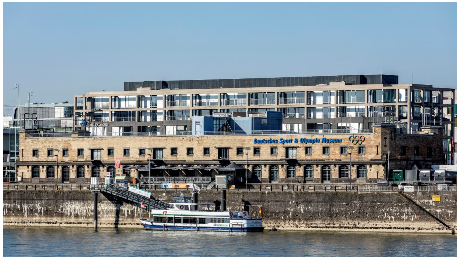
KölnTourismus, Foto: Christoph Seelbach