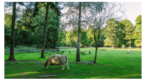
Animals in Cologne's Forrest