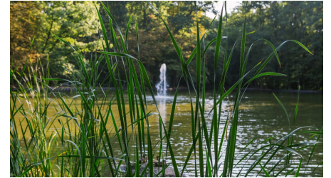
Stadtwald Cologne