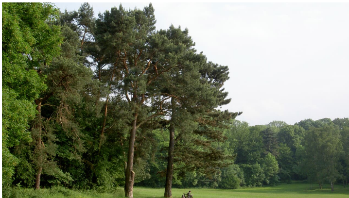
Stadtwald Cologne