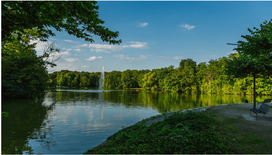
Stadtwald Cologne