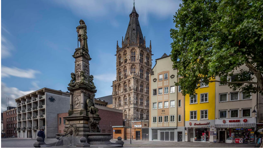
Cologne Town hall