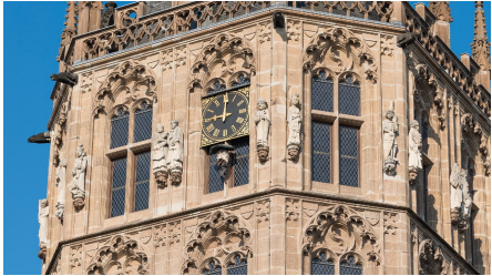
historical town hall cologne