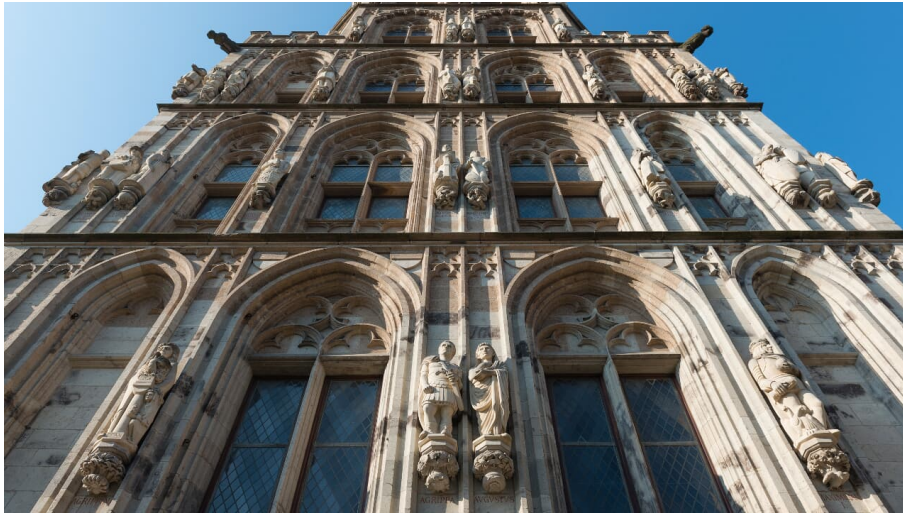
historical town hall cologne