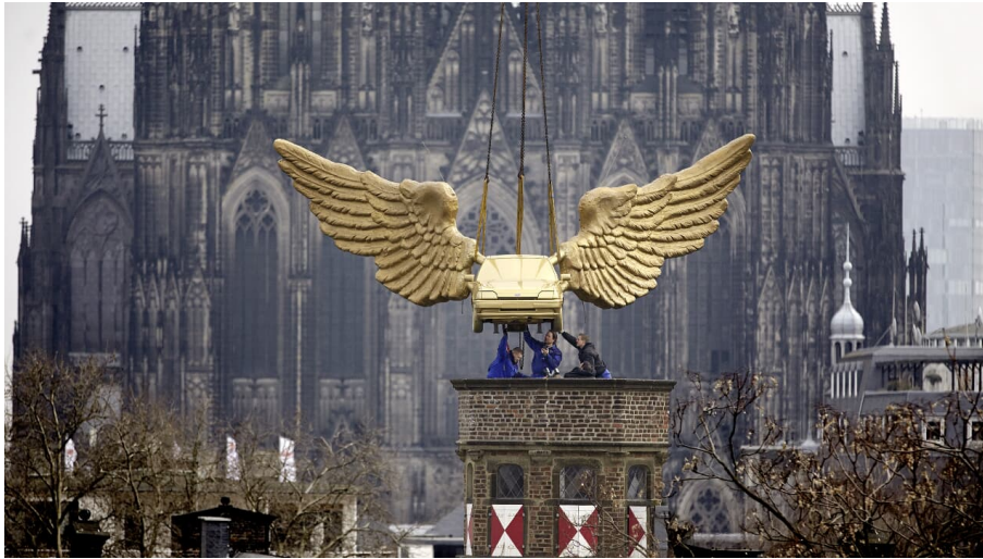
KölnTourismus GmbH, Axel Schulten