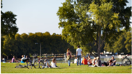
Aachener Weiher, Cologne