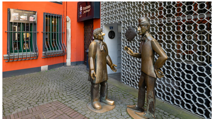
TOMY BADURINA FOTOGRAFIE