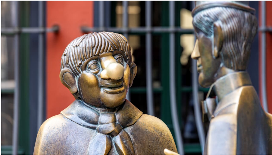
KölnTourismus, Foto: Christoph Seelbach