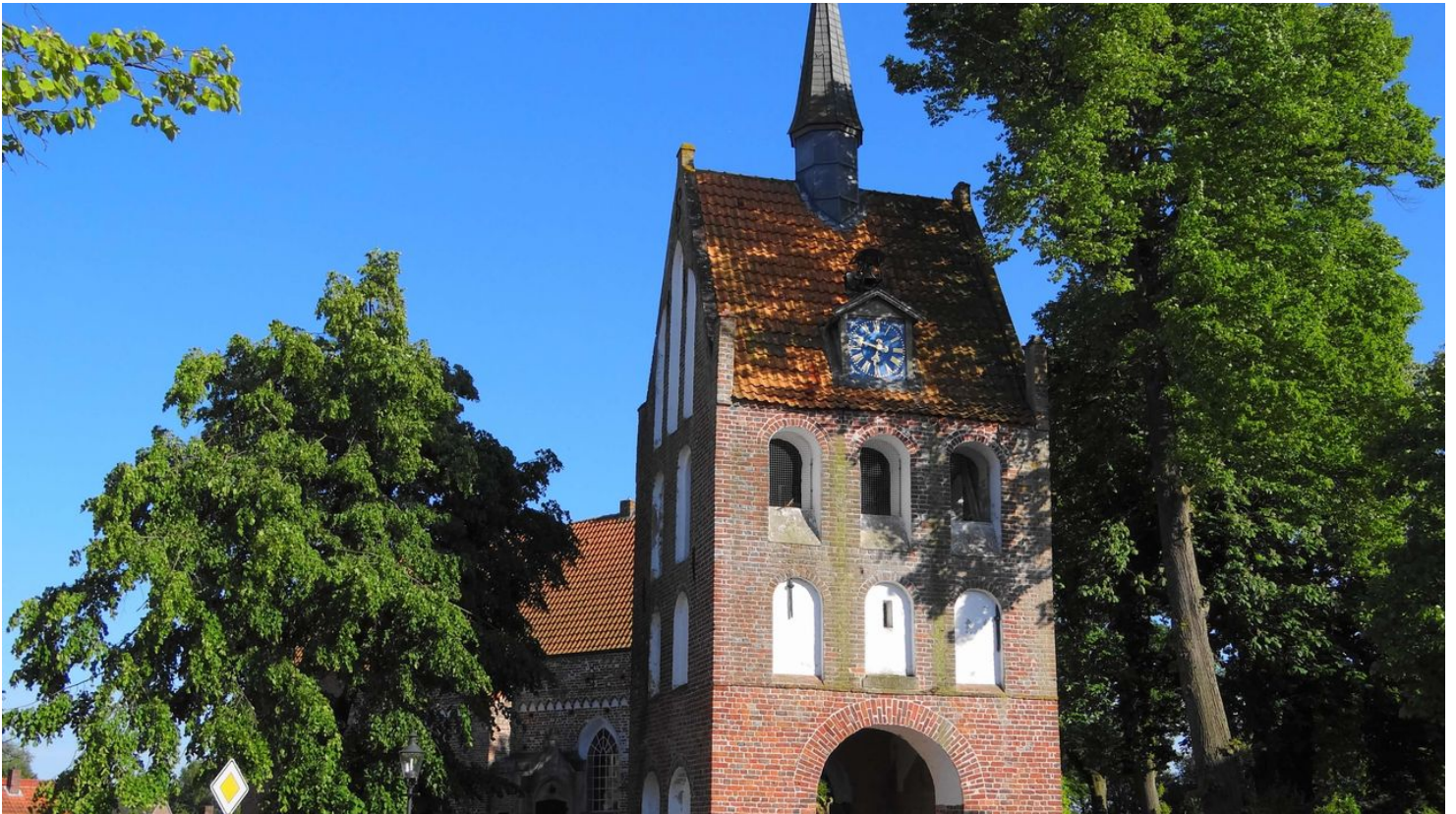
St. Nikolai Glockenturm Apen