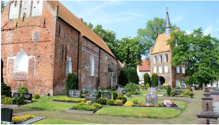
St. Nikolai Apen