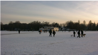
Bad Zwischenahner Touristik GmbH - info@bad-zwischenahn-touristik.de