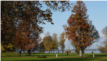
Bad Zwischenahner Touristik GmbH - info@bad-zwischenahn-touristik.de