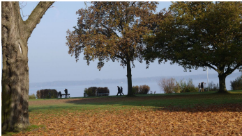
Bad Zwischenahner Touristik GmbH - info@bad-zwischenahn-touristik.de