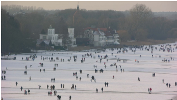
Bad Zwischenahner Touristik GmbH - info@bad-zwischenahn-touristik.de