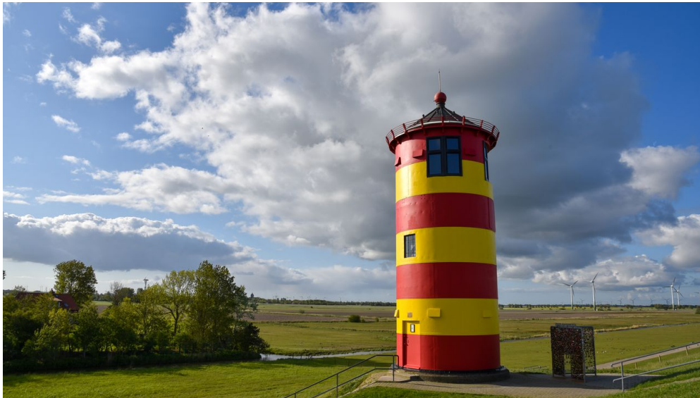
Pilsumer Leuchtturm