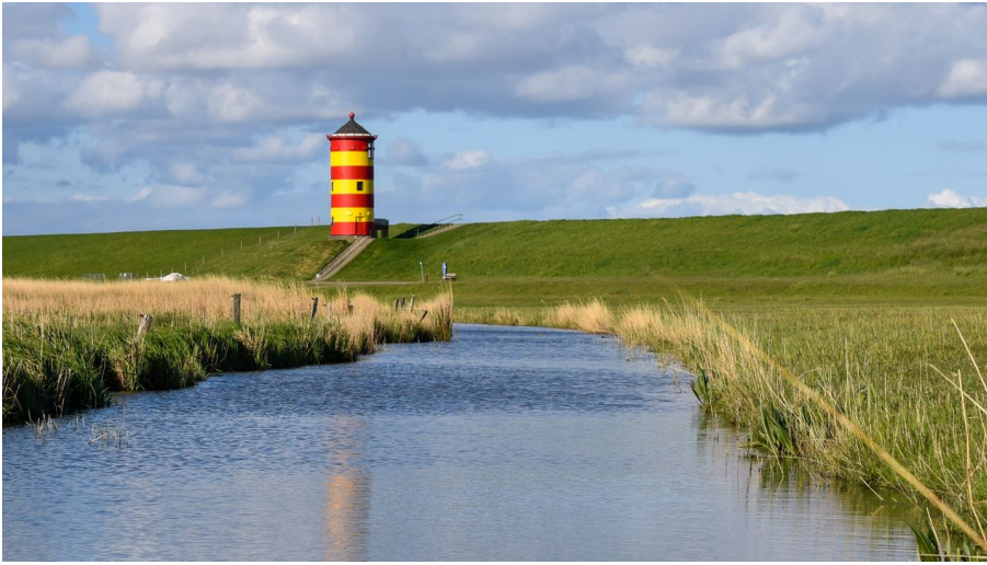
Pilsumer Leuchtturm