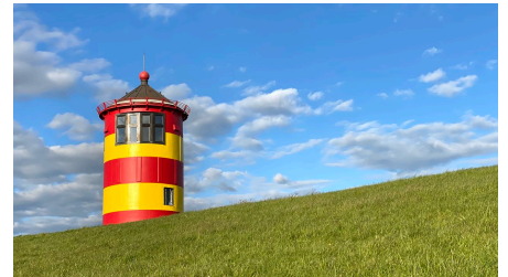
Pilsumer Leuchtturm