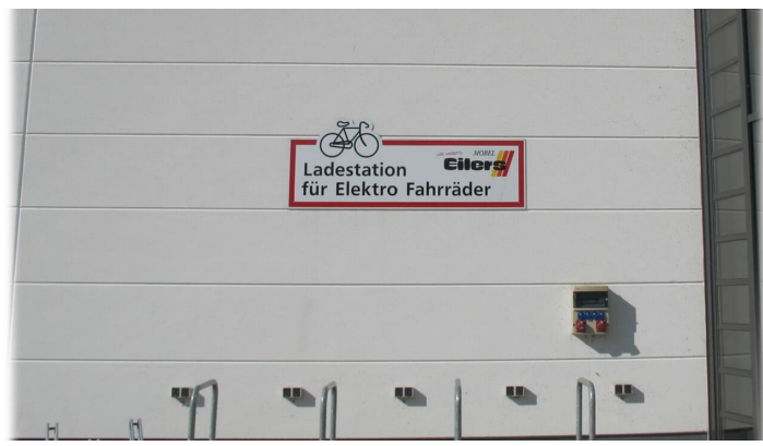
E-Bike Ladestation_Möbel Eilers_Apen - © Marion Schäfer/2018

Source: destination.one ID: p_100035696 Last changed on 25.08.2023, 11:20