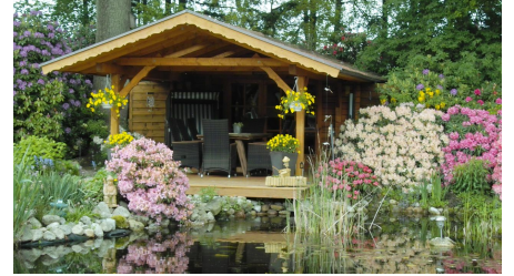
Teichanlage mit Gartenhütte