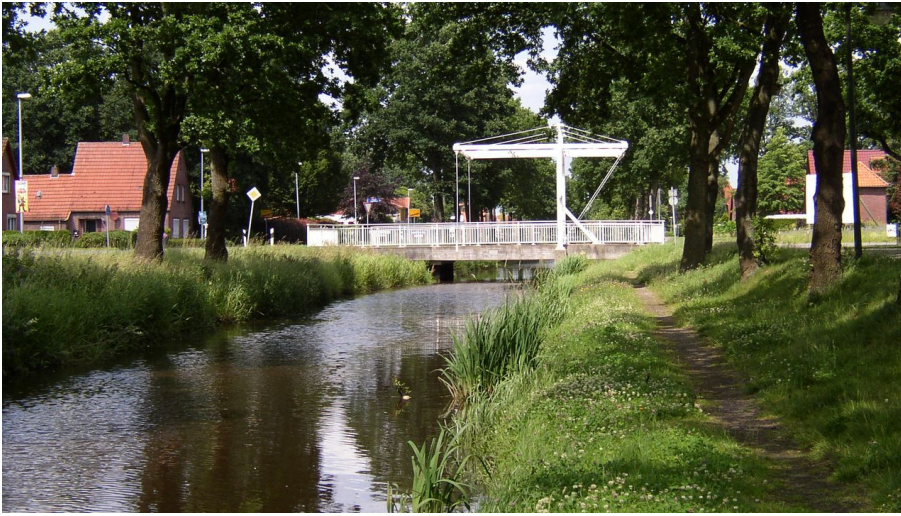
Augustfehn Kanal mit Treidelpfad