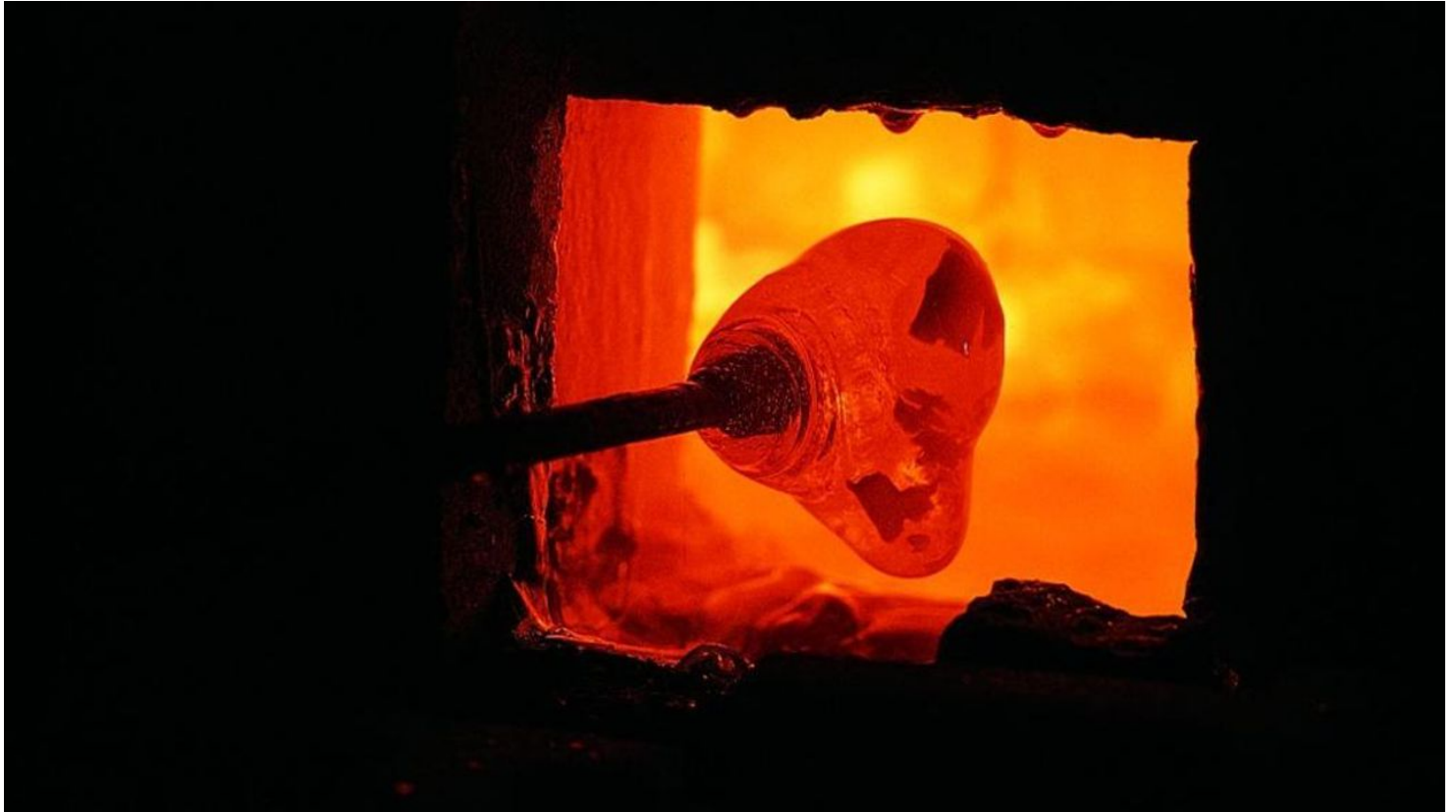
Bad Driburger Touristik GmbH

ID: p_100038554 Last changed on 11.04.2024, 10:15