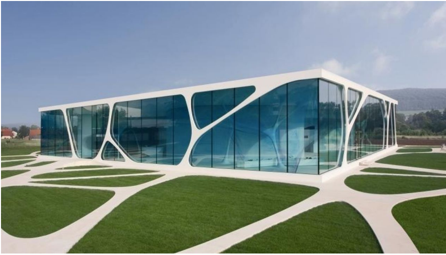
LEONARDO - glaskoch B. Koch jr. GmbH + Co. KG