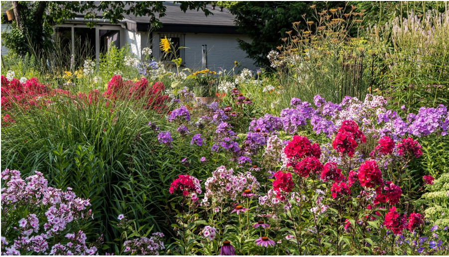
garten-stolle-wiefelstede-6 - © Ferdinand Graf Luckner