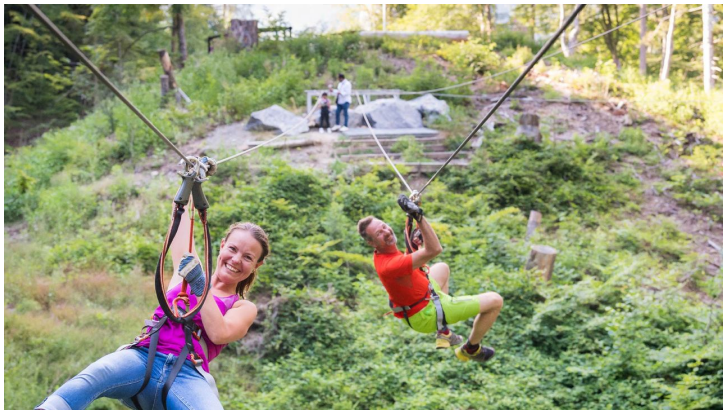
Outdoor Switzerland AG, Interlaken Tourismus - web@interlaktourism.ch