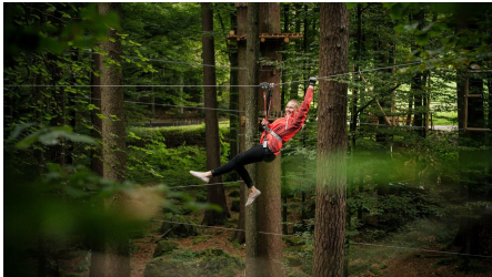
Outdoor Switzerland AG, Interlaken Tourismus - web@interlaketourism.ch