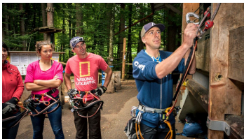
Outdoor Switzerland AG, Interlaken Tourismus - web@interlaktourism.ch