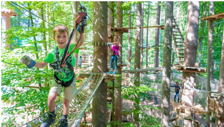
Outdoor Switzerland AG, Interlaken Tourismus - web@interlaktourism.ch