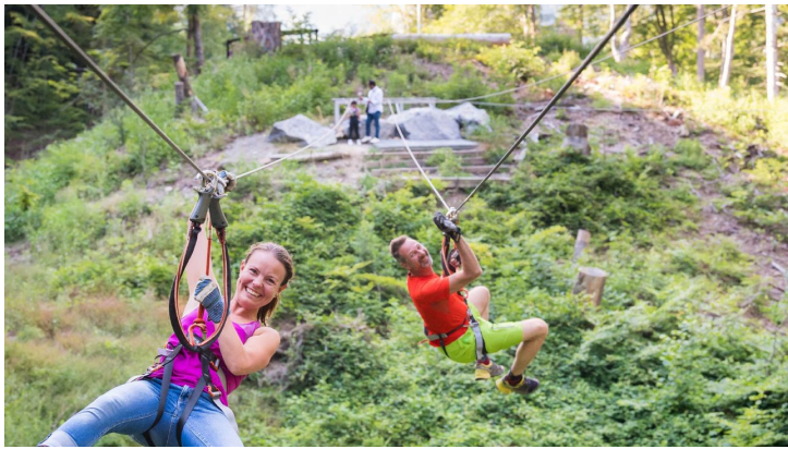
Outdoor Switzerland AG, Interlaken Tourismus - web@interlaktourism.ch