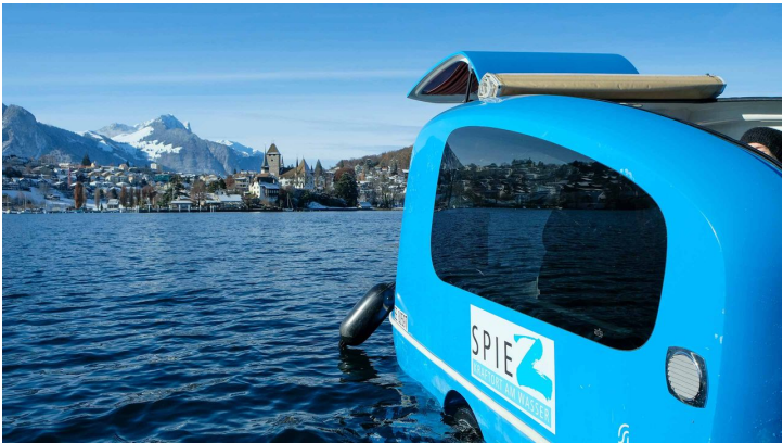
Spiez Marketing AG, Interlaken Tourismus - web@interlaketourism.ch