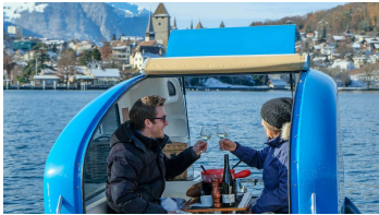
Spiez Marketing AG, Interlaken Tourismus - web@interlaketourism.ch