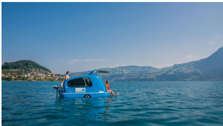
Spiez Marketing AG, Interlaken Tourismus - web@interlaketourism.ch