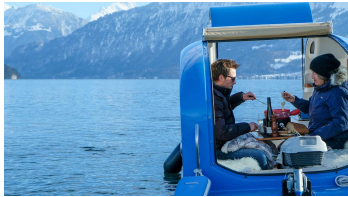
Spiez Marketing AG, Interlaken Tourismus - web@interlaketourism.ch