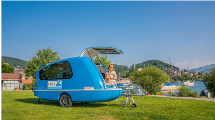
Spiez Marketing AG, Interlaken Tourismus - web@interlaketourism.ch