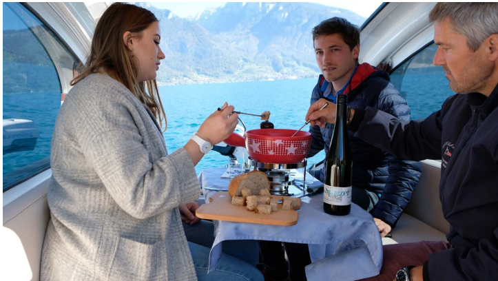
Spiez Marketing AG, Interlaken Tourismus - web@interlaketourism.ch