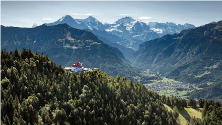
Jungfraubahnen AG, Interlaken Tourismus - web@interlaketourism.ch