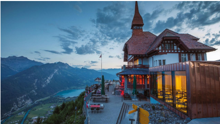
Jungfraubahnen AG, Interlaken Tourismus - web@interlaketourism.ch