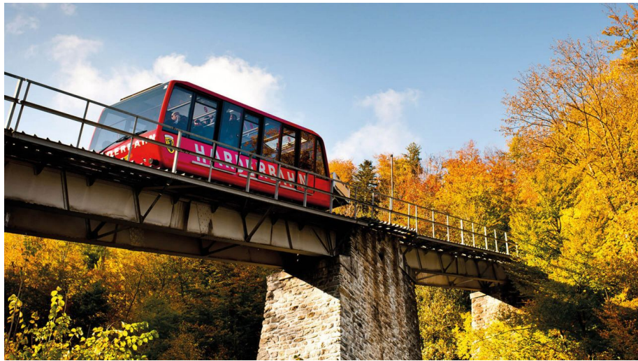
Jungfraubahnen AG, Interlaken Tourismus - web@interlaketourismus.ch