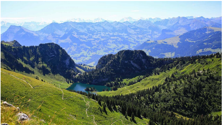
Thun-Thunersee Tourismus, Interlaken Tourismus - web@interlaketourism.ch