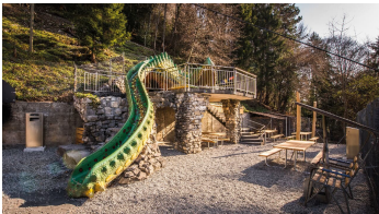
St. Beatus-Höhlen