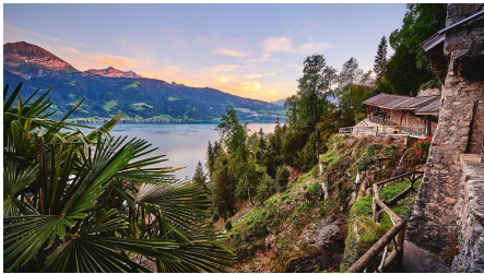
St. Beatus-Höhlen