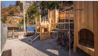
St. Beatus-Höhlen