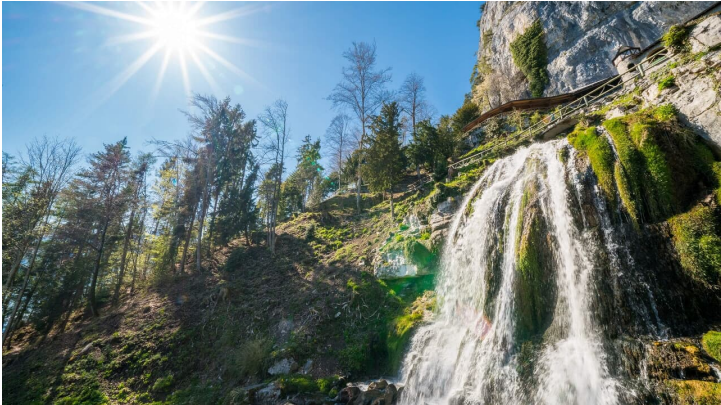
St. Beatus-Höhlen