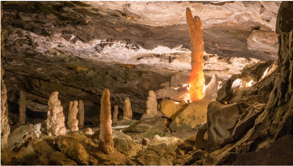
St. Beatus-Höhlen