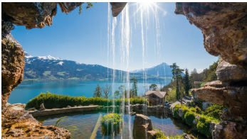
St. Beatus-Höhlen