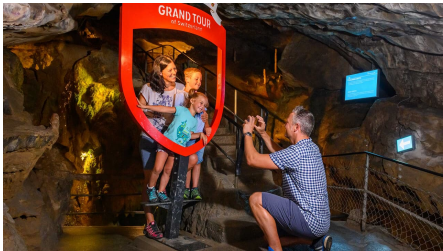
St. Beatus-Höhlen, Interlaken Tourismus - web@interlaketourism.ch