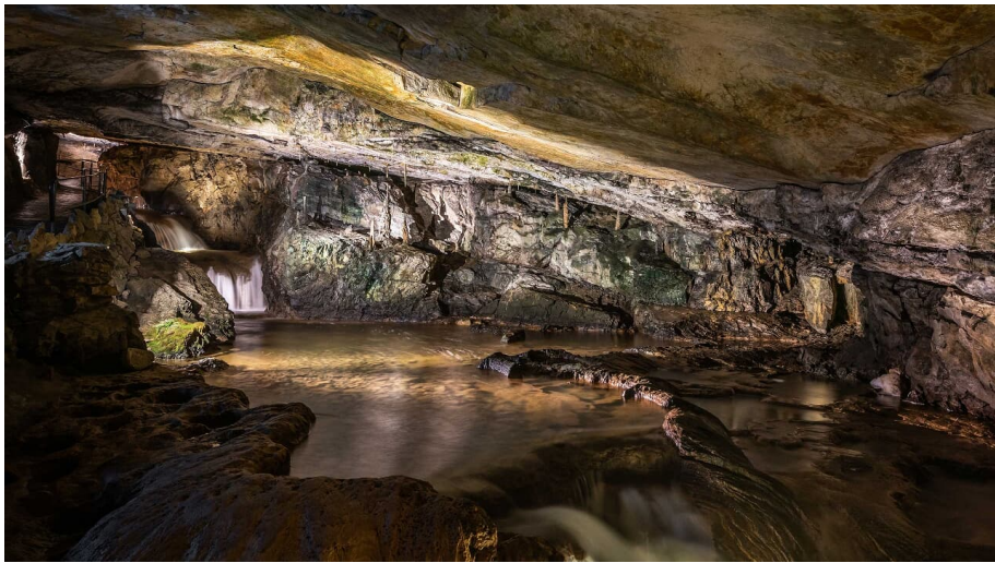
St. Beatus-Höhlen