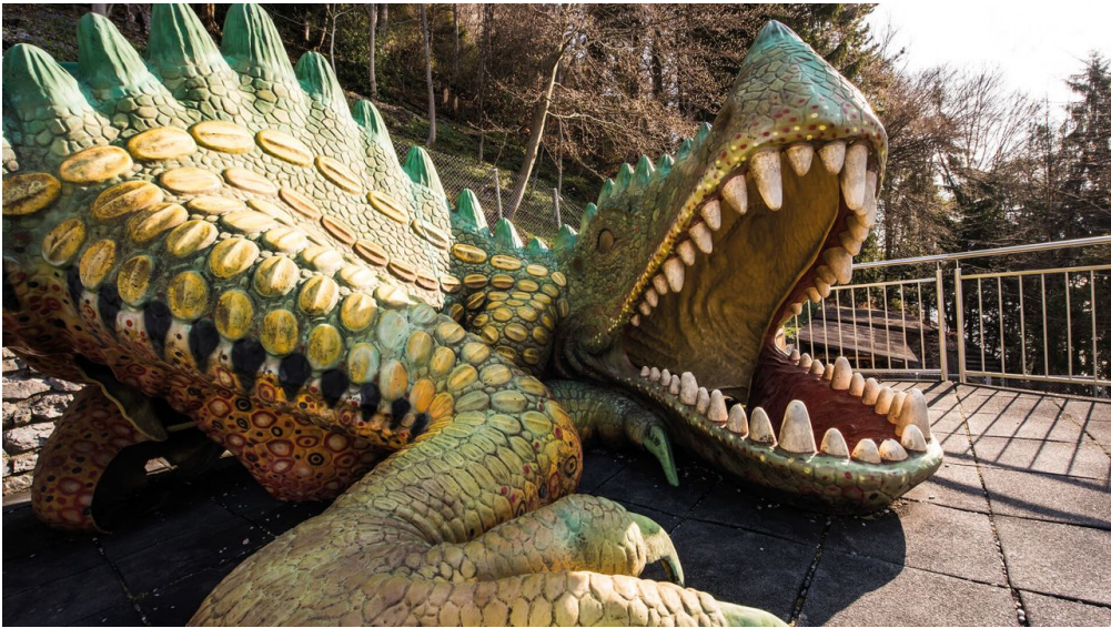
St. Beatus-Höhlen