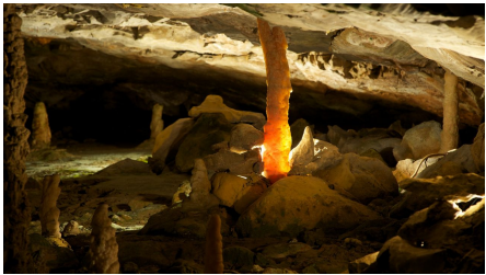
St. Beatus-Höhlen