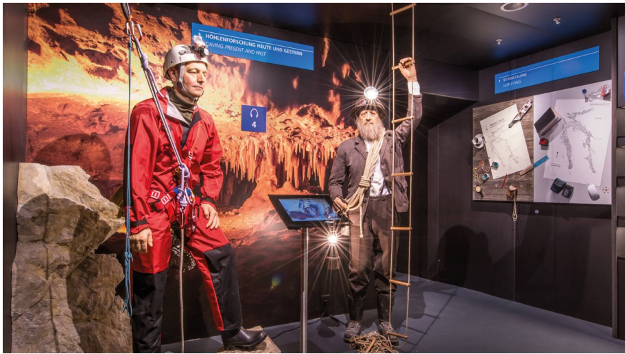
St. Beatus-Höhlen