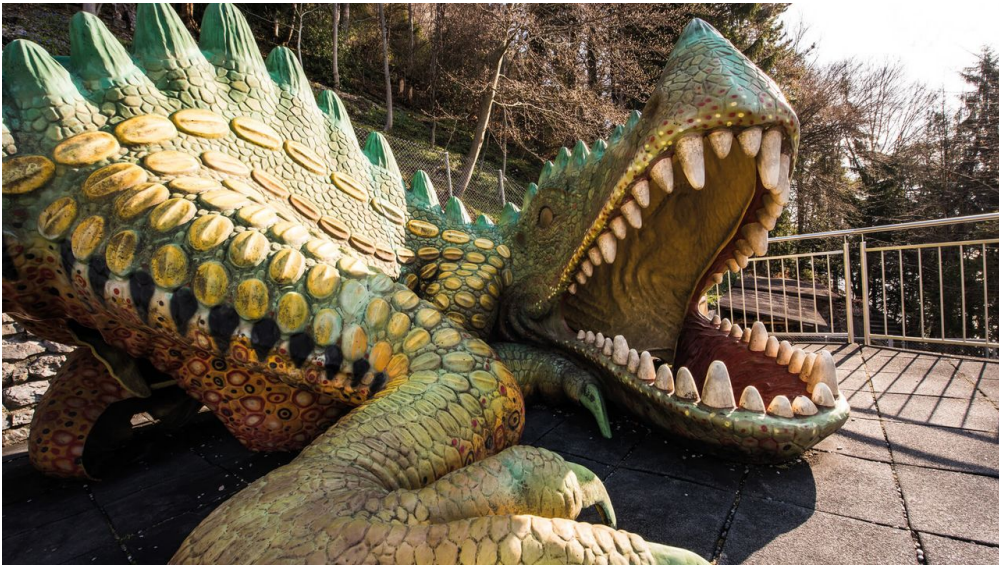
St. Beatus-Höhlen