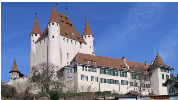
Schloss Thun