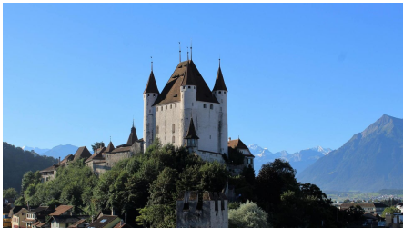
Schloss Thun