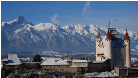
Schloss Thun