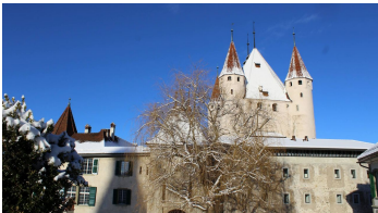
Schloss Thun