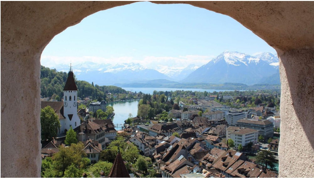
Schloss Thun