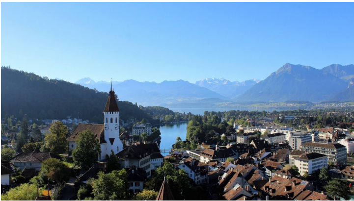
Schloss Thun