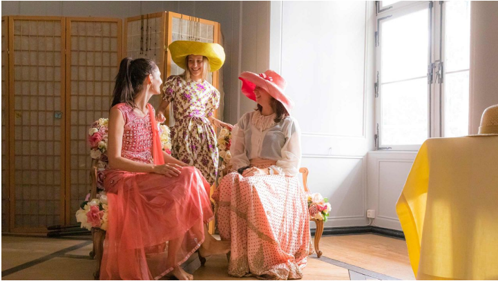
Schloss Oberhofen