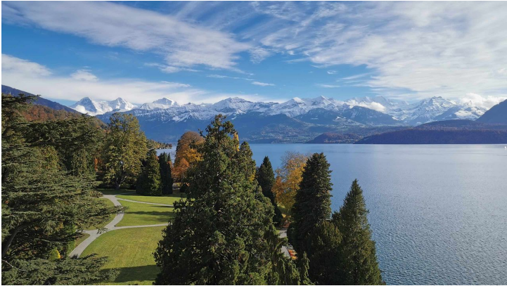
Schloss Oberhofen