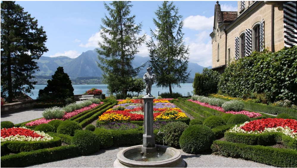
Schloss Oberhofen