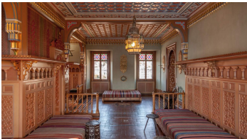
Schloss Oberhofen