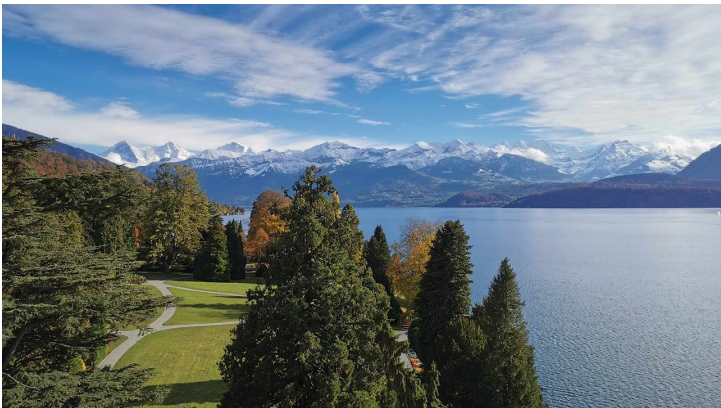
Schloss Oberhofen