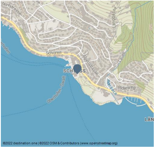
©2022 destination.one | ©2022 OSM & Contributors (www.openstreetmap.org)