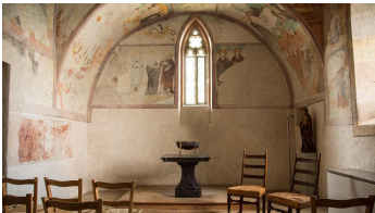
Schloss Oberhofen