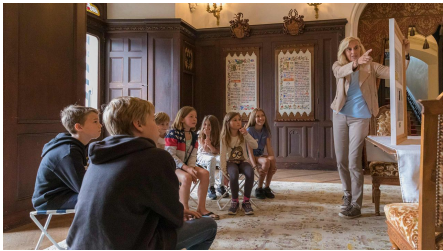
Schloss Oberhofen