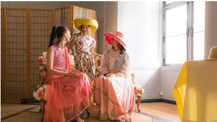
Schloss Oberhofen