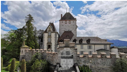
Schloss Oberhofen