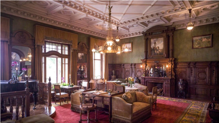
Stiftung Schloss Hühnegg