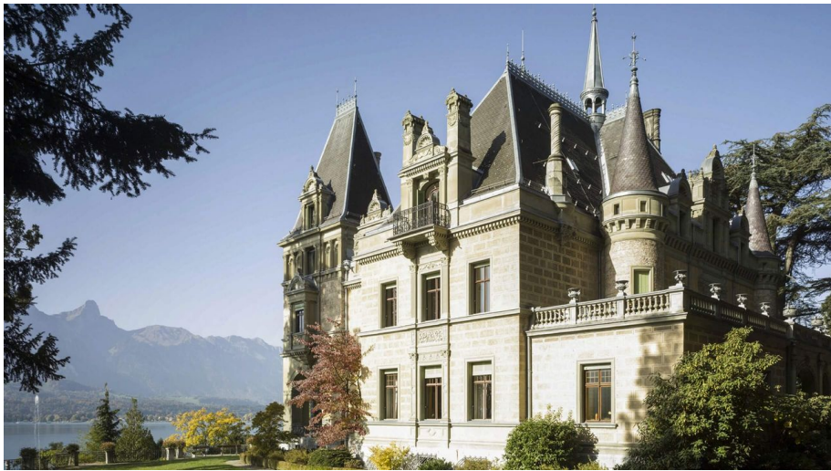
Stiftung Schloss Hühnegg, Interlaken Tourismus - web@interlaketourism.ch

museums castles historic buildings parks / gardens summer