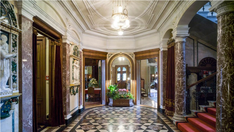
Stiftung Schloss Hühnegg, Interlaken Tourismus - web@interlaketourism.ch

Closed mid-October to Moteher's Day Saison 2024: Sunday, 12 May until Sunday, 20 October Museum & castle café: Tuesday – Saturday 14 – 17 h, Sundays & public holidays 11 – 17 h Brocante Royal: Sat 14 - 17 h & Sun 11 - 17 h