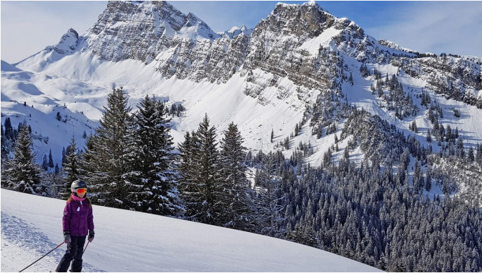
Grimmialpbergbahnen AG, Interlaken Tourismus - web@interlaketourism.ch

Summer operation: 8 June to 20 October 2024 every Saturday and Sunday from 9.30 – 12.15 h and from 12.45 –16.30 h During the summer and autumn holidays: Summer holidays 10 July to 13 August 2024 Autumn holidays 25 September – 13 October 2024 Wednesday – Sunday in each case Operating hours: 9.30 – 12.15 h and from 12.45 – 16.30 h Winter operation: Winter weekend operation as soon as possible, continuously from mid-December 2024 if there is enough snow until mid-March 2025. Please note the information under "Current operating information" at www.grimmialp.ch * In case of bad weather, operation is cancelled. Please inform yourself about the current operation. Personal information, tel. +41 (0)33 684 12 92 in case of doubtful weather conditions. In case of bad weather, operation will not start. Information at grimmialp.ch or tel. +41 (0)33 684 12 92