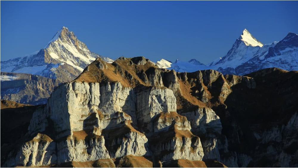
Interlaken Tourismus - web@interlaketourism.ch

Openinghours _____ Beginning of September – beginning of October