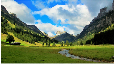
Interlaken Tourismus - web@interlaketourism.ch