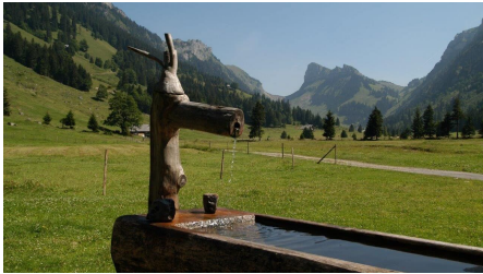
Interlaken Tourismus - web@interlaketourism.ch