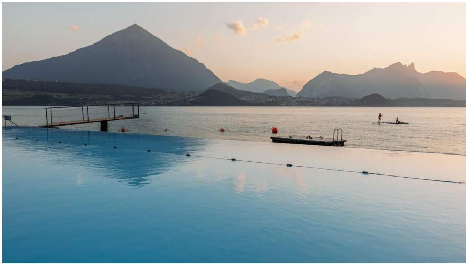
Strandbad Merligen

outdoor swimming pools Disability Access summer