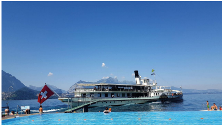
Strandbad Merligen