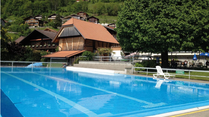
Strandbad Merligen