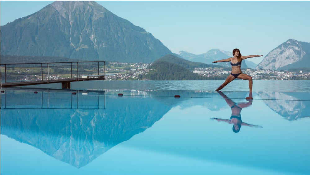
Strandbad Merligen, Interlaken Tourismus - web@interlaketourism.ch

Mid-May - mid-September 09.30 - 19.00h. July - mid-August until 21.00h in good weather. Closed in bad weather.