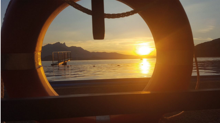
Strandbad Merligen