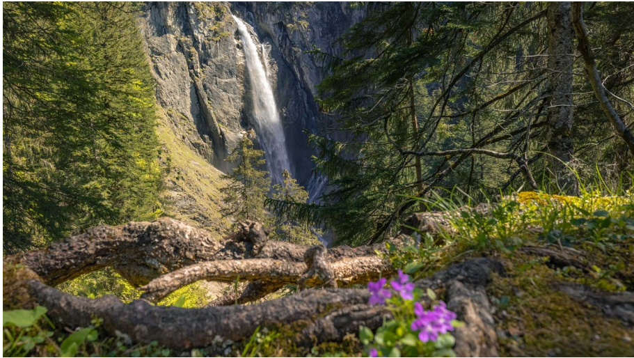
Interlaken Tourismus - web@interlaketourism.ch