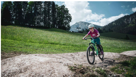
Wiriehornbahnen, Interlaken Tourismus - web@interlaketourism.ch