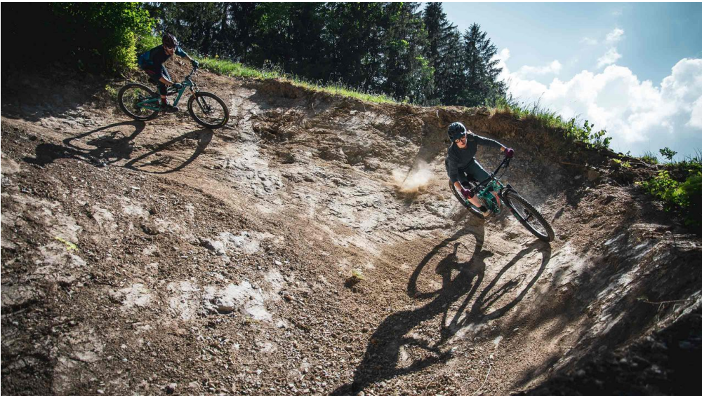
Wiriehornbahnen, Interlaken Tourismus - web@interlaketourism.ch

_____ Mai – June Weekend operation / July – mid-October daily / Mid-October to the first snow Weekend operation * The operation of the Wiriehorn mountain railways are adapted to the weather conditions. * Information: www.wiriehorn.ch , or info telephone +41 33 684 12 33