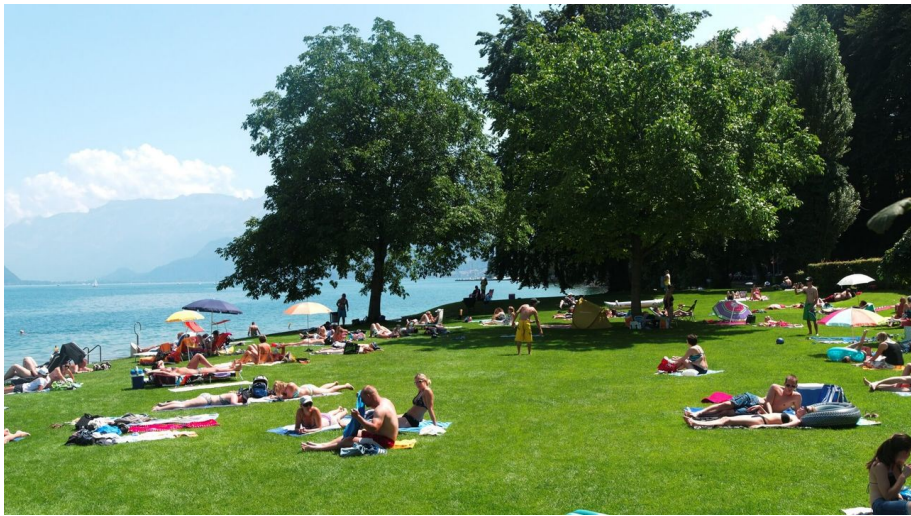
Strandbad Faulensee