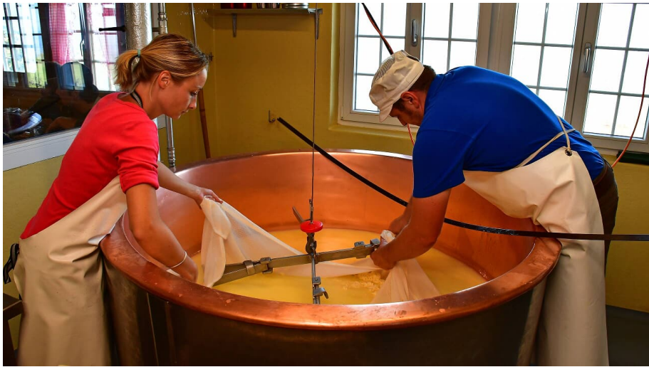
Aeschi Tourismus, Interlaken Tourismus - web@interlaktourismus.ch

craft farm shop/direct sales guides summer