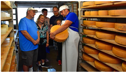
Aeschi Tourismus, Interlaken Tourismus - web@interlaktourism.ch