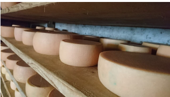
Aeschi Tourismus, Interlaken Tourismus - web@interlaktourism.ch