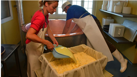
Aeschi Tourismus, Interlaken Tourismus - web@interlaktourism.ch