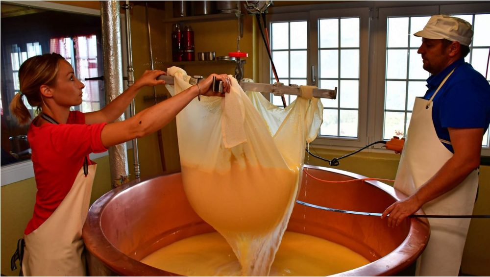
Aeschi Tourismus, Interlaken Tourismus - web@interlaktourism.ch