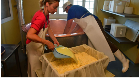
Aeschi Tourismus, Interlaken Tourismus - web@interlaktourism.ch