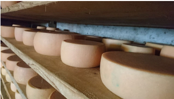
Aeschi Tourismus, Interlaken Tourismus - web@interlaktourism.ch