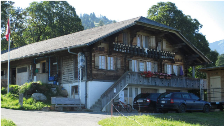
Aeschi Tourismus, Interlaken Tourismus - web@interlaktourism.ch