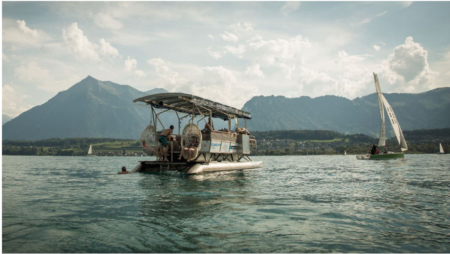
Solarschiff Thun

shipping ferries / Water Transportation Disability Access summer