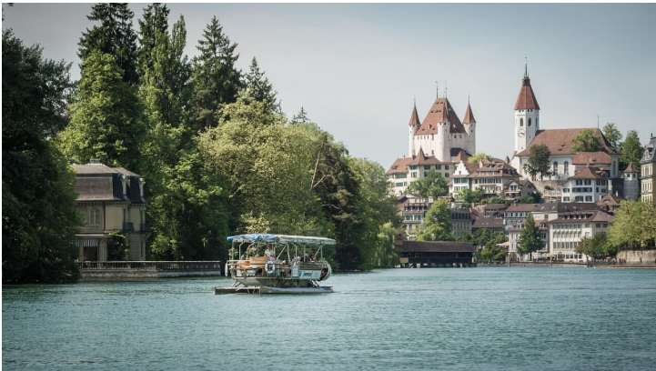
Solarschiff Thun