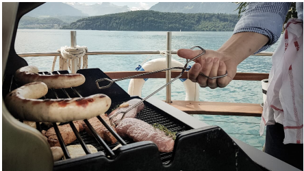
Solarschiff Thun