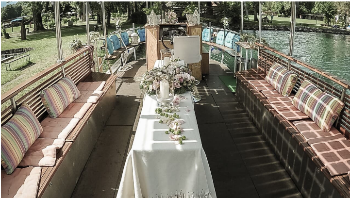
Solarschiff Thun