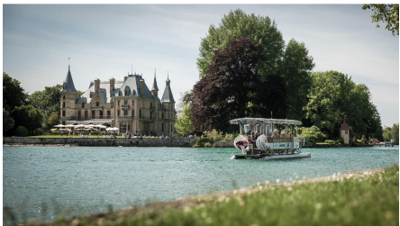
Solarschiff Thun