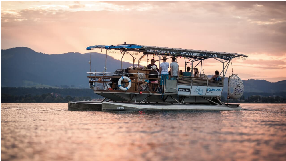
Solarschiff Thun