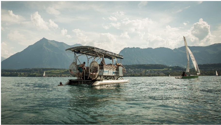
Solarschiff Thun

shipping ferries / Water Transportation Disability Access summer