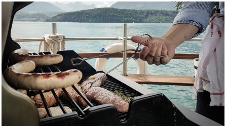
Solarschiff Thun