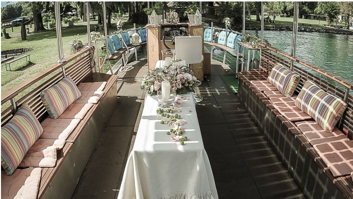
Solarschiff Thun