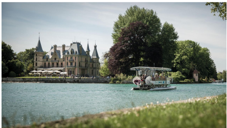
Solarschiff Thun