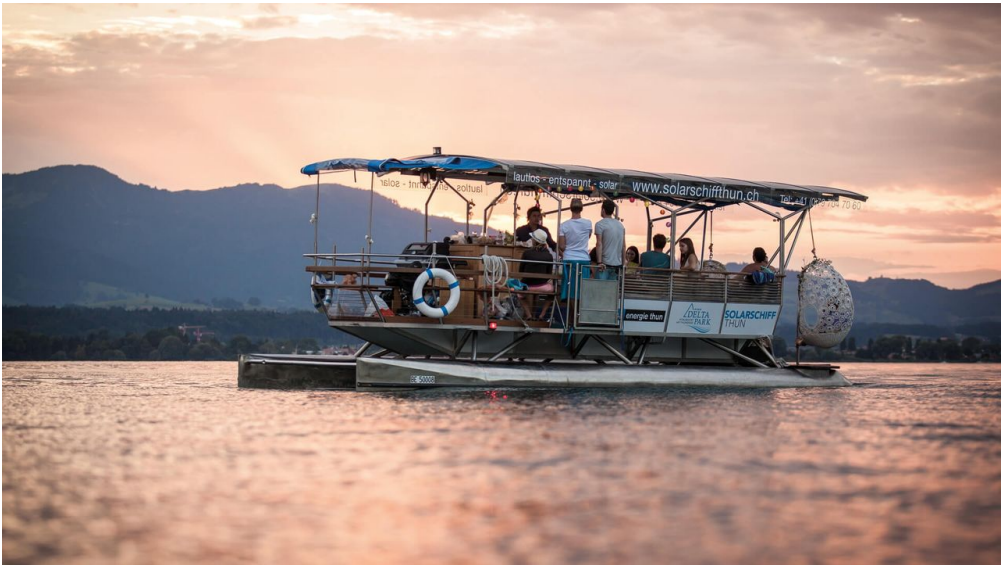
Solarschiff Thun