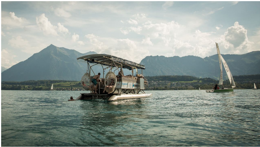
Solarschiff Thun