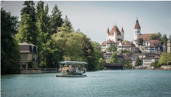
Solarschiff Thun