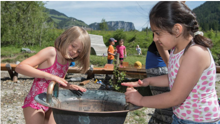
Naturpark Diemtigtal