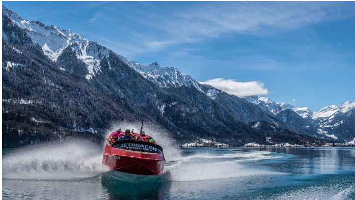
Jetboat Interlaken / Outdoor Switzerland AG, Interlaken Tourismus - web@interlaktourism.ch