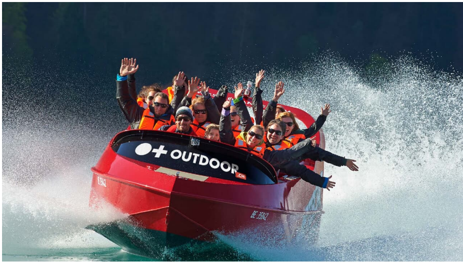
Outdoor Switzerland, Interlaken Tourismus - web@interlaketourism.ch