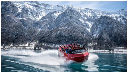
Jetboat Interlaken / Outdoor Switzerland AG, Interlaken Tourismus - web@interlaktourism.ch