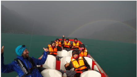
Jetboat Interlaken