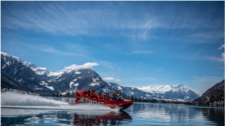
Jetboat Interlaken