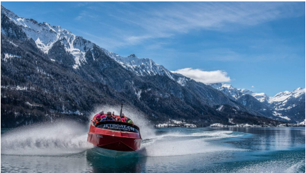
Jetboat Interlaken