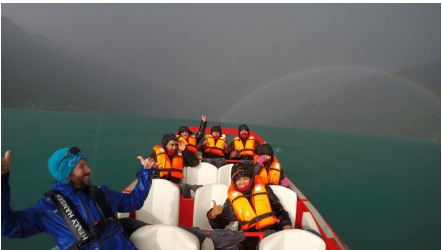
Jetboat Interlaken / Outdoor Switzerland AG, Interlaken Tourismus - web@interlaketourism.ch