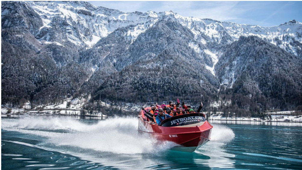
Jetboat Interlaken

Summer season April – October Winter season November – March