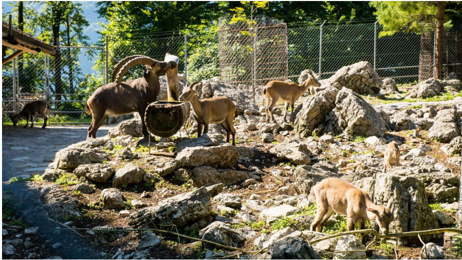
Wildpark Brienzi, Interlaken Tourismus - web@interlaketourism.ch