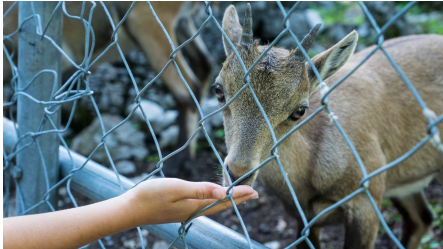
Wildpark Brienz