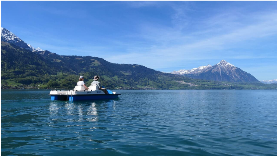
Mountainsurf, Interlaken Tourismus - web@interlaketourism.ch

fun sports cayak / canoe / boat SUP boat / pedalo hire summer