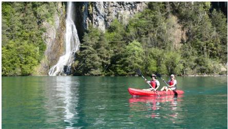
Mountainsurf, Interlaken Tourismus - web@interlaktourismus.ch