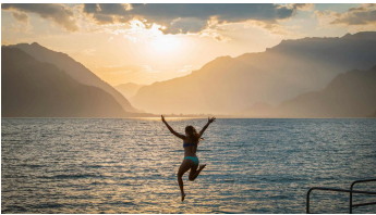
Krattigen Tourismus, Interlaken Tourismus - web@interlaketourism.ch