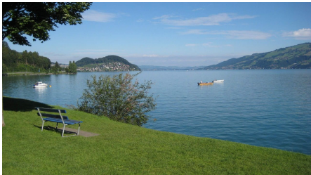
Krattigen Tourismus, Interlaken Tourismus - web@interlaketourism.ch