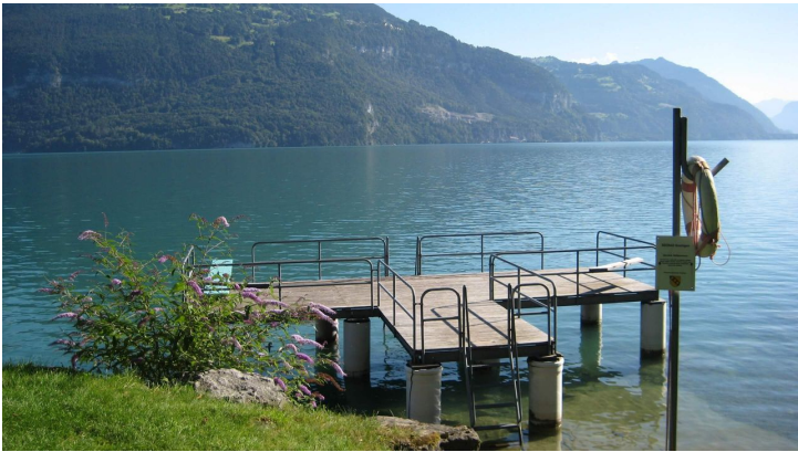
Krattigen Tourismus, Interlaken Tourismus - web@interlaketourism.ch