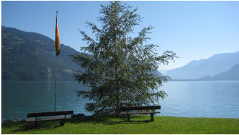
Krattigen Tourismus, Interlaken Tourismus - web@interlaketourism.ch