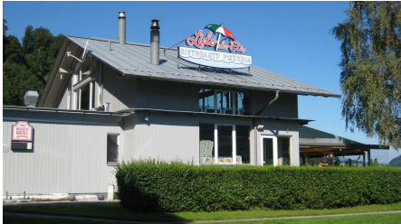
Krattigen Tourismus, Interlaken Tourismus - web@interlaketourism.ch