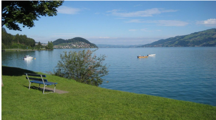
Krattigen Tourismus, Interlaken Tourismus - web@interlaketourism.ch