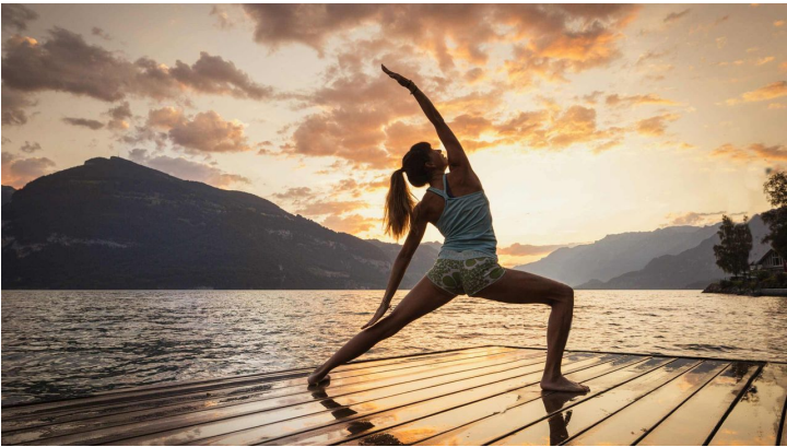
Krattigen Tourismus, Interlaken Tourismus - web@interlaketourism.ch