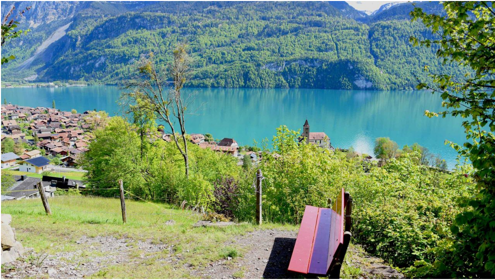
Thun-Thunersee Tourismus, Interlaken Tourismus - web@interlaketourism.ch