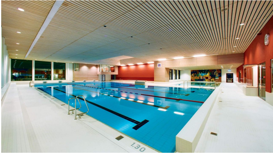
Freiluft- Hallenbad Bödeli AG