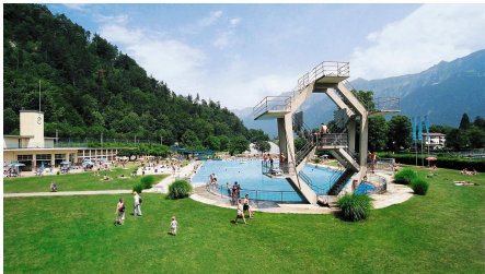
Freiluft- Hallenbad Bödeli AG, Interlaken Tourismus - web@interlaketourism.ch