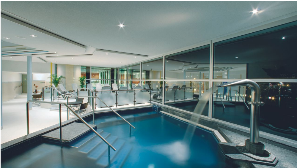
Freiluft- Hallenbad Bödeli AG