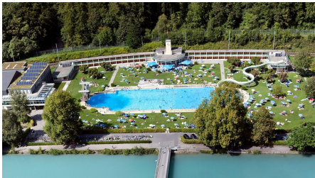
Freiluft- Hallenbad Bödeli AG