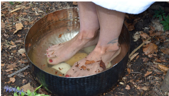
SALZANO Hotel – Spa – Restaurant