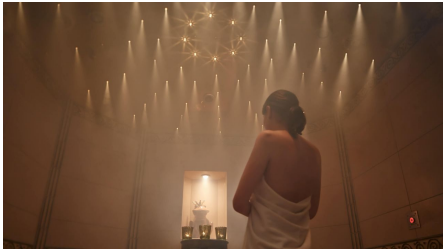
SALZANO Hotel – Spa – Restaurant