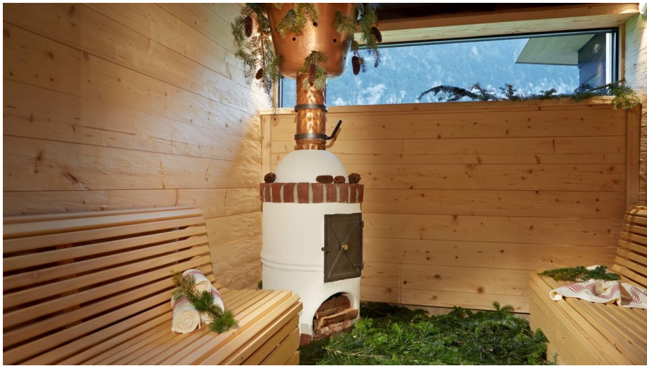
SALZANO Hotel – Spa – Restaurant, Interlaken Tourismus - web@interlaktourismus.ch