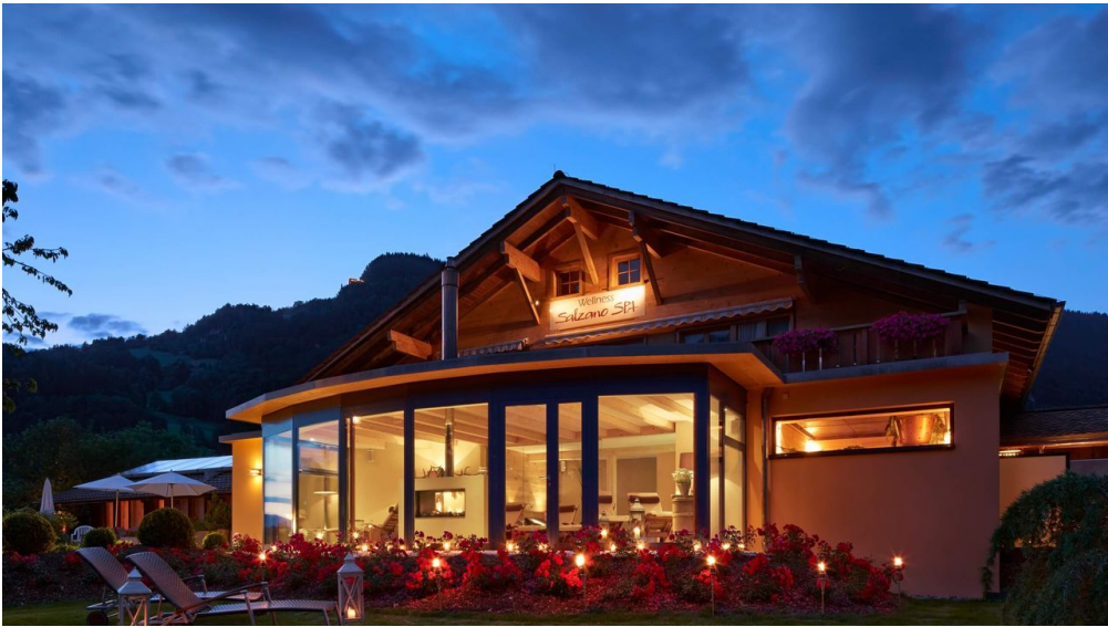
SALZANO Hotel – Spa – Restaurant, Interlaken Tourismus - web@interlaketourism.ch

_____ 14.00 - 21.30 h / last check in at 20.00 h Saturday, 14.00 - 18.00 h exclusively for hotel guests / 18.00 - 21.30 h on request