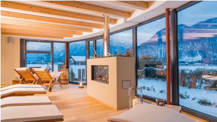
SALZANO Hotel – Spa – Restaurant, Interlaken Tourismus - web@interlaketourism.ch