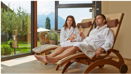
SALZANO Hotel – Spa – Restaurant, Interlaken Tourismus - web@interlaketourism.ch