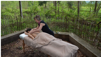
SALZANO Hotel – Spa – Restaurant, Interlaken Tourismus - web@interlaketourism.ch