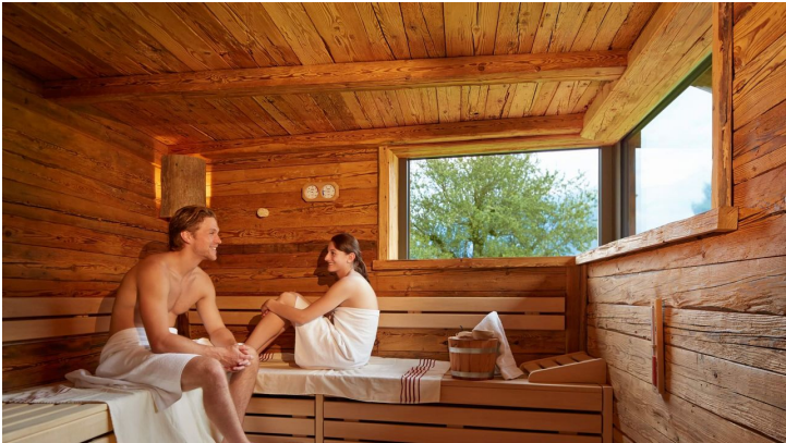
SALZANO Hotel – Spa – Restaurant, Interlaken Tourismus - web@interlaketourism.ch