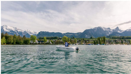
Deltapark Vitalresort