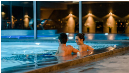
Deltapark Vitalresort