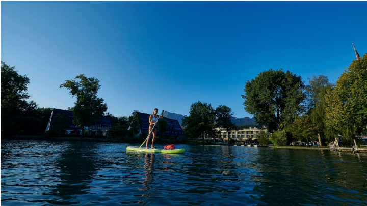
Deltapark Vitalresort, Interlaken Tourismus - web@interlakentourism.ch