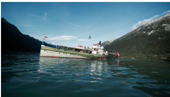
BLS AG, Schifffahrt, Interlaken Tourismus - web@interlaketourism.ch