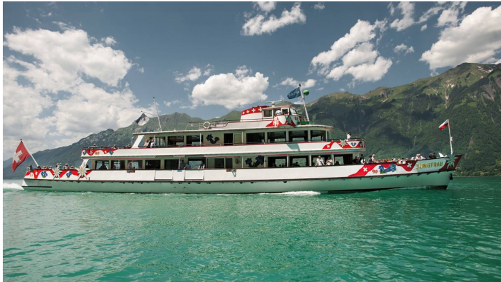
BLS AG, Schifffahrt, Interlaken Tourismus - web@interlaketourism.ch

Tourismus-Organisation Interlaken, Interlaken Tourismus - web@interlaketourism.ch