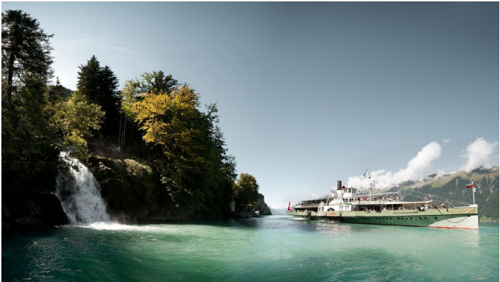
BLS AG, Schifffahrt, Interlaken Tourismus - web@interlaketourism.ch