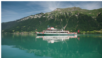
BLS AG, Schifffahrt, Interlaken Tourismus - web@interlaketourism.ch