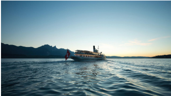
BLS AG, Schifffahrt - web@interlaketourism.ch