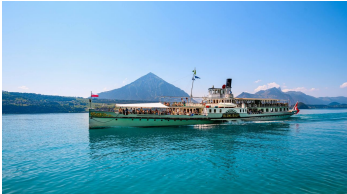
BLS Schifffahrt AG, Interlaken Tourismus - web@interlaketourism.ch