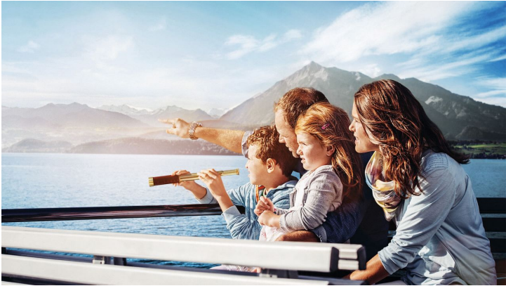
BLS AG, Schifffahrt, Interlaken Tourismus - web@interlaketourism.ch